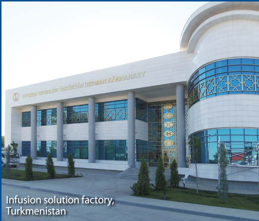
Infusion solution factory, Turkmenistan