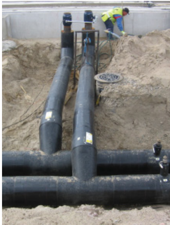
Elomatic offers comprehensive design and expert services for district heating suppliers

Our experts conduct energy audits for industry, communes and real estate companies according to Motiva models. The audit leads to recommendations for financially profitable operations. Diverse measurements and process analyses are also part of our services.